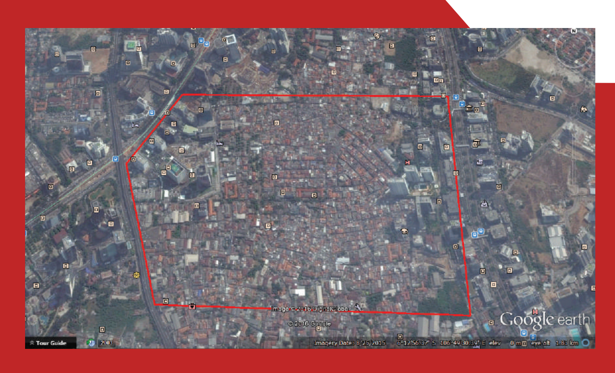
Karet study site from google maps

Karet is a central district with many large office buildings, and while some may choose to prepare food at home and bring it with them to work, it seems that most of the workers purchase lunch from the area around their workplace.